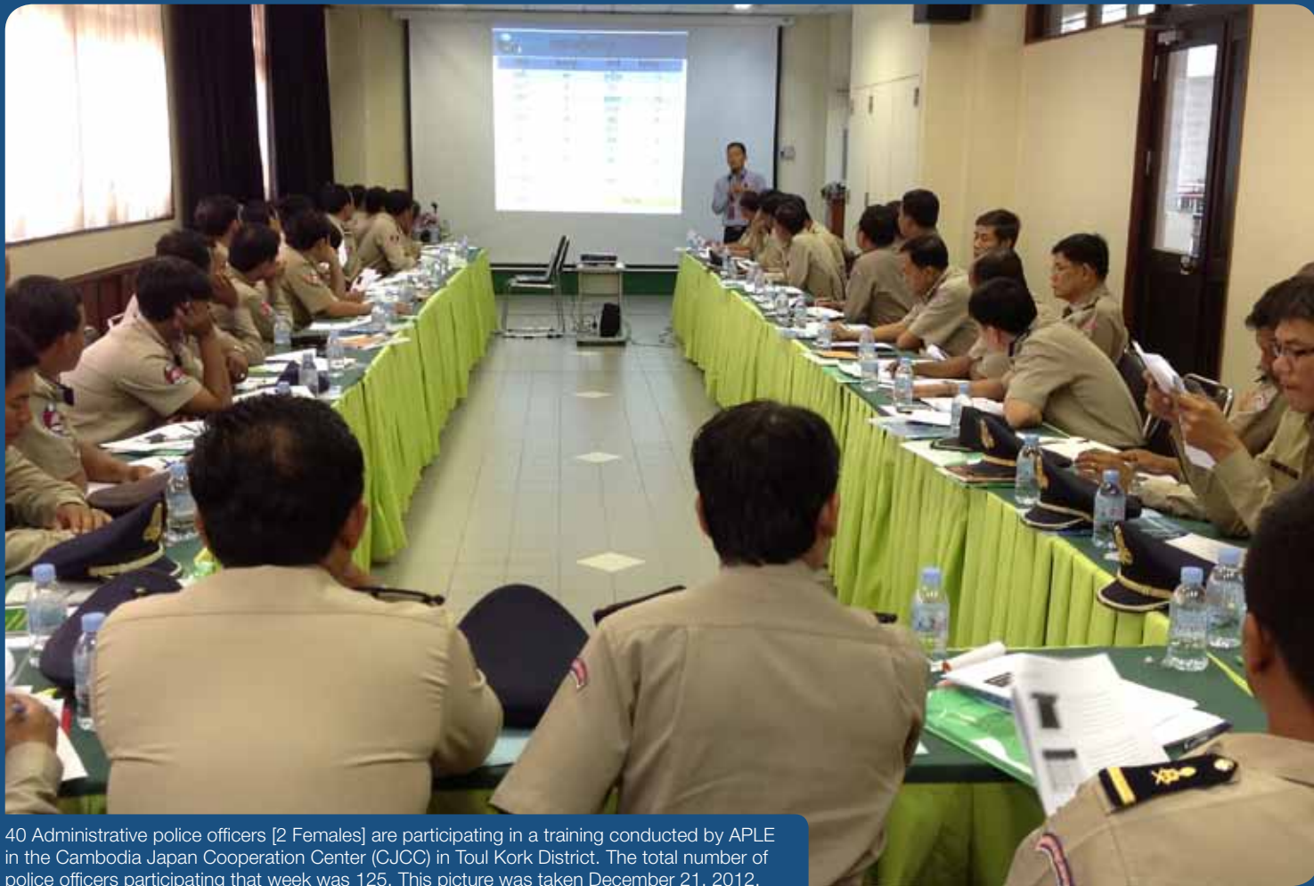
40 Administrative police officers [2 Females] are participating in a training conducted by APLE in the Cambodia Japan Cooperation Center (CJCC) in Toul Kork District. The total number of police officers participating that week was 125. This picture was taken December 21, 2012.