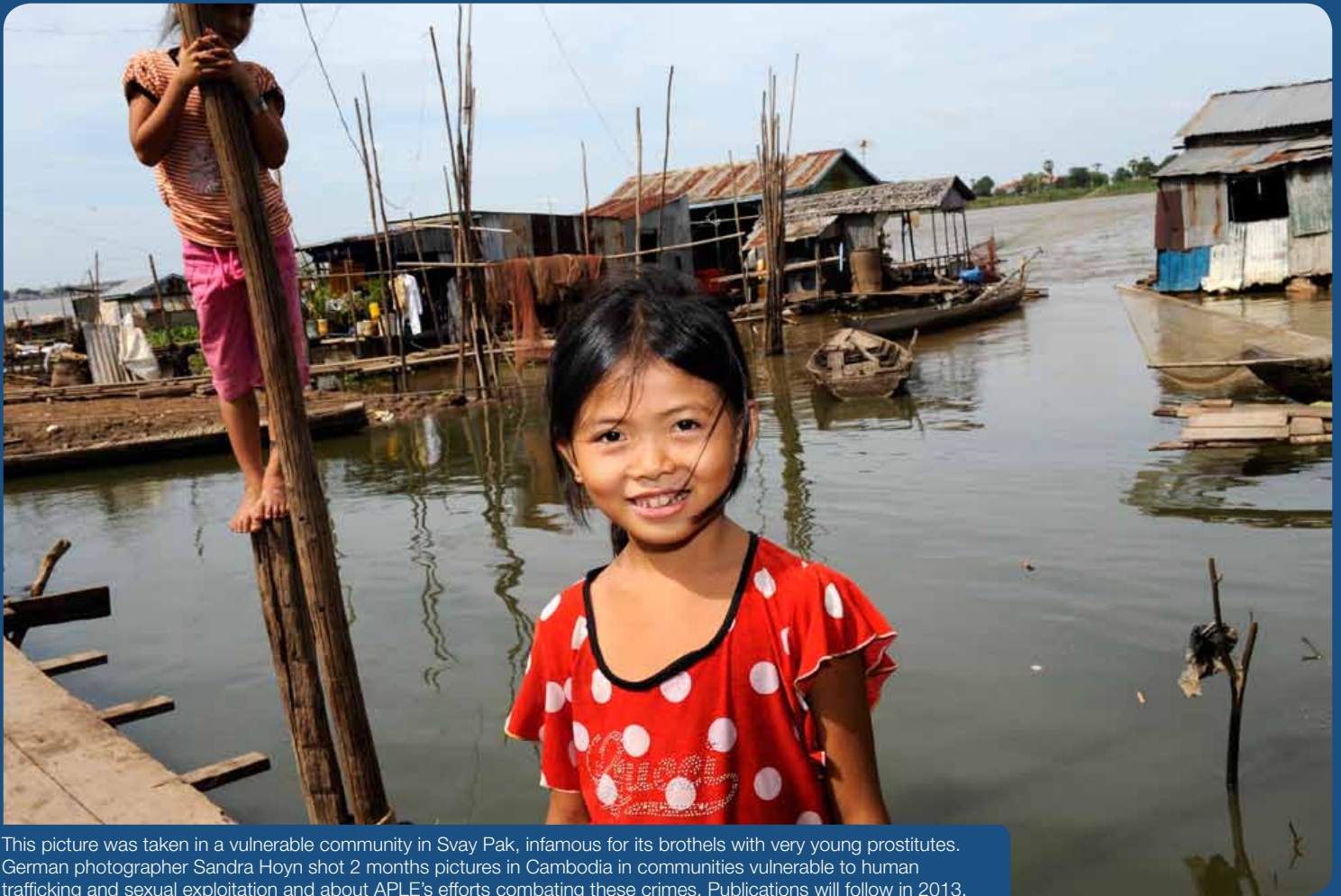
This picture was taken in a vulnerable community in Svay Pak, infamous for its brothels with very young prostitutes. German photographer Sandra Hoyn shot 2 months pictures in Cambodia in communities vulnerable to human trafficking and sexual exploitation and about APLE's efforts combating these crimes. Publications will follow in 2013.