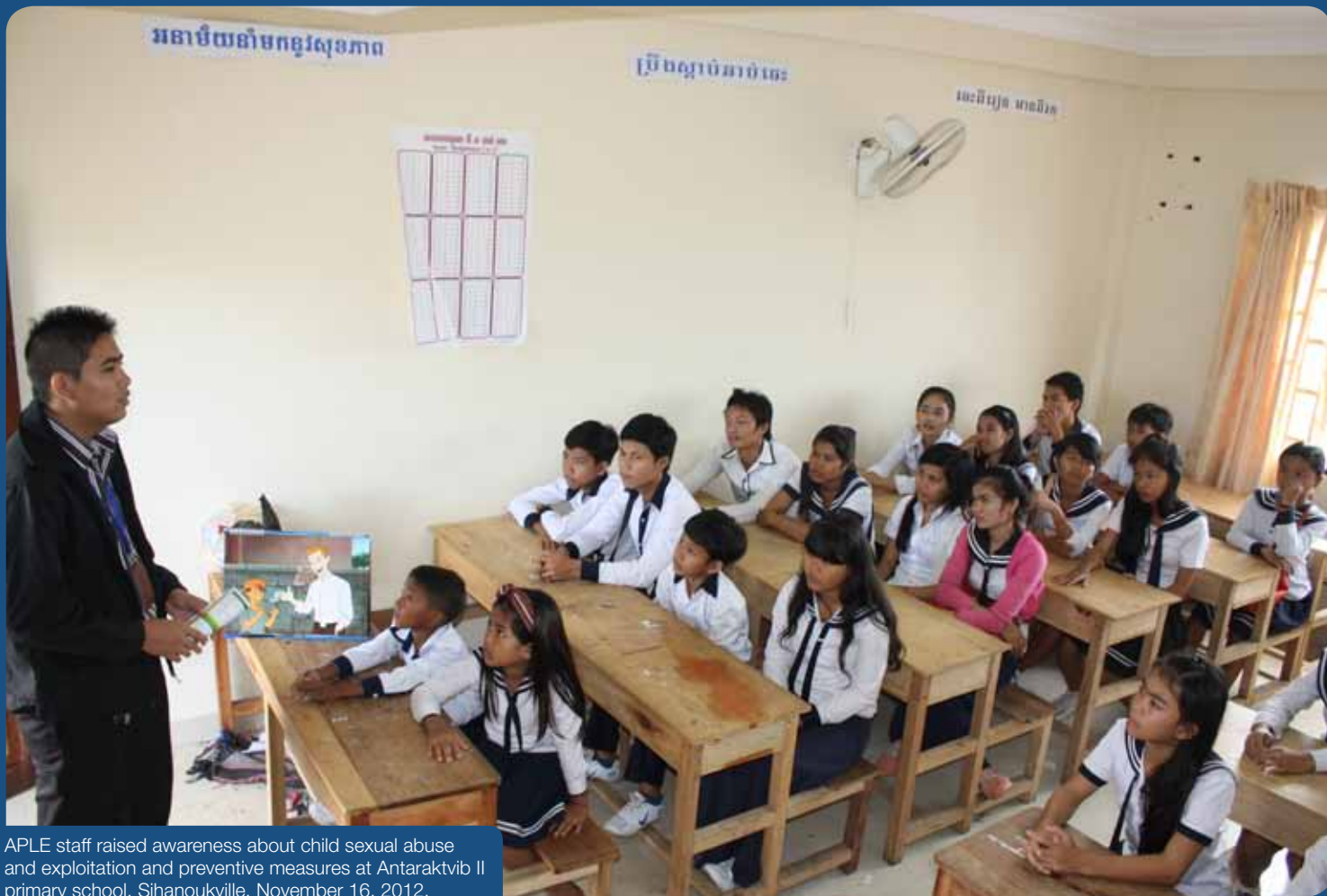
APLE staff raised awareness about child sexual abuse and exploitation and preventive measures at Antaraktvib II primary school, Sihanoukville, November 16, 2012.