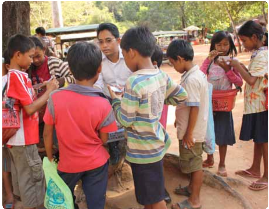
APLE Siem Reap branch staff provided information cards with helpline number 092 311 511 to 13 children at Bantey Srey and Ta Prom temples and hung posters at restaurants frequented by foreigners, Siem Reap, on November 27, 2012.

Our training programs play a vital role in exposing child sexual abuse and exploitation and human trafficking. They enable people to identify the danger signs and to report suspected cases to APLE and/or police. Our awareness activities with the aim to prevent abuse have reached ten-thousands of villagers, vulnerable children and families, students, law enforcement agents, court -, local -, commune - and national authorities.