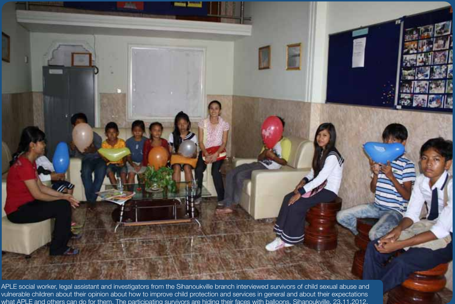
APLE social worker, legal assistant and investigators from the Sihanoukville branch interviewed survivors of child sexual abuse and vulnerable children about their opinion about how to improve child protection and services in general and about their expectations what APLE and others can do for them. The participating survivors are hiding their faces with balloons. Sihanoukville, 23.11.2012.