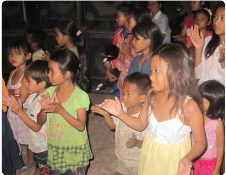
450 Villagers enjoyed the music from The Kampot Playboys in Ka Ort Village, Kampong Tralach District, Kampong Chhnang Province, on February 11, 2012.

See: http://www.indiegogo.com/aplecambodia