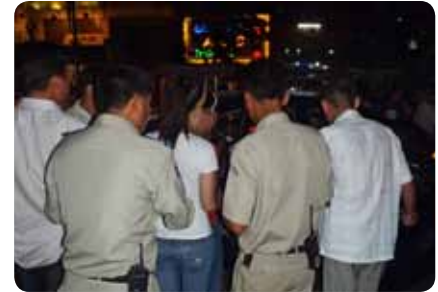
Raid at Mey Long barbershop, Phnom Penh, December 3, 2012.